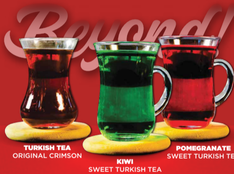
TURKISH TEA ORIGINAL CRIMSON