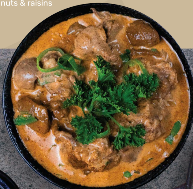
SPICY CHICKEN LIVERS