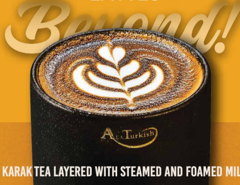
KARAK TEA LAYERED WITH STEAMED AND FOAMED MILK